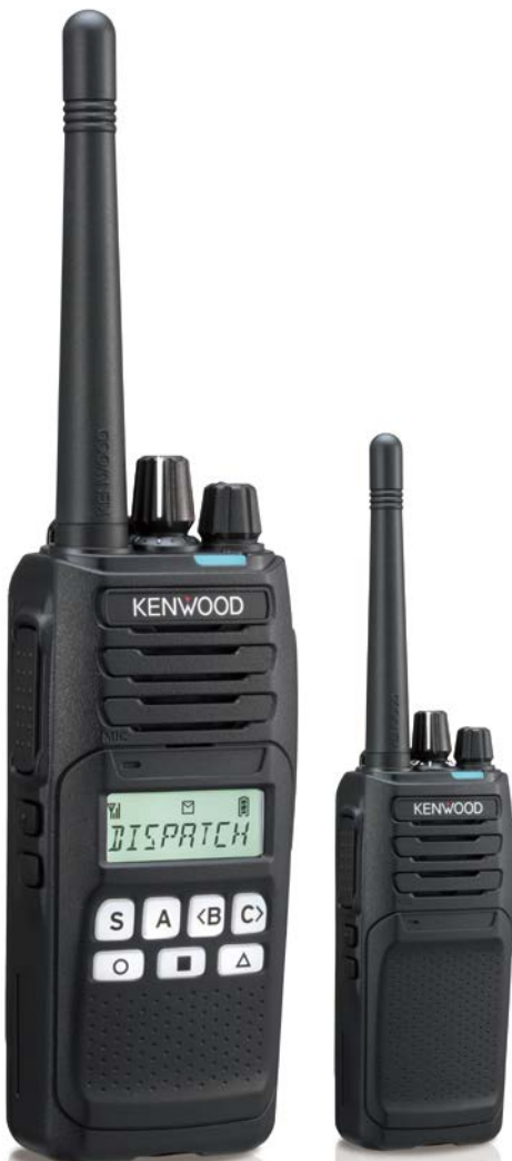
Standard Keypad model

If you are thinking of harnessing the latest digital protocols – NXDN or DMR – to enhance business efficiency or FM analog for its simplicity, the NX-1200/1300 has you covered. Our One-“K”-Fits-All solution offers the widest selection of two-way radios for everyday use. The model matrix also includes basic and keypad variations, with or without a high-contrast backlit LCD. Other features include a 7-color LED indicator and the popular KENWOOD 2-pin audio accessory connector. Plus, mixed-mode operation ensures seamless integration with legacy radios while smoothing the onward migration path to digital. But whatever your specific needs, audio quality is what determines clear voice communications – which is why KENWOOD radios are used under the most grueling conditions, like the cockpit of a racing car. Thanks to our extensive experience with professional systems, reliability is second to none. So whatever your radio requirements, KENWOOD’s NX-1200/1300 offers a single platform that’s right for you.